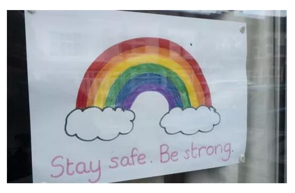
"After every storm, there is a rainbow. If you have eyes, you will find it. If you have wisdom, you will create it. If you have love for yourself and others, you won't need it."

Thank you so much for your continued support during this time.